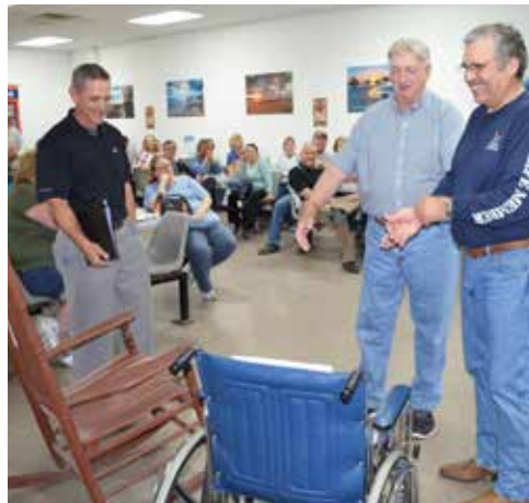
"Do you want to rock...or do you want to roll?"