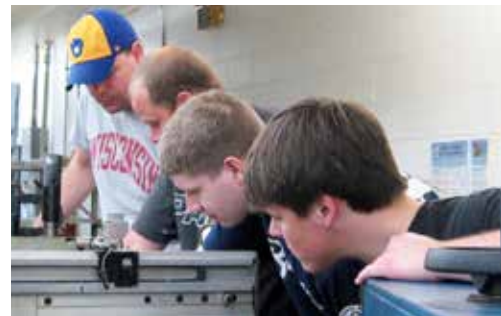
A little thoughtful con-‘template’-ion?

Using 6 people, we were able to change over the press in 8 minutes with the registration of the first print being reasonably close. Our templates needed some refinement and our people needed some additional training, but the concept was there.