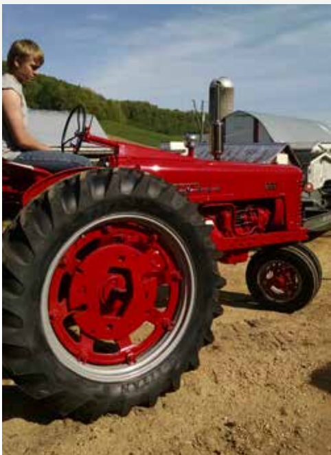
A boy & his tractor