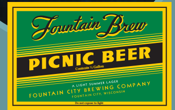
LABELS RECREATED FROM OLD SAMPLES