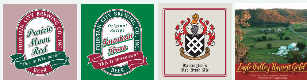
LABELS RECREATED FROM OLD SAMPLES