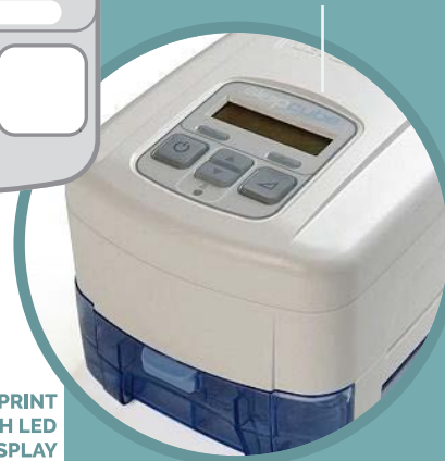
SCREEN PRINT OVERLAY WITH LED WINDOWS, DISPLAY WINDOW, AND EMBOSSED BUTTONS