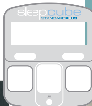
SCREEN PRINT OVERLAY WITH CLEAR WINDOWS AND CUTOUTS